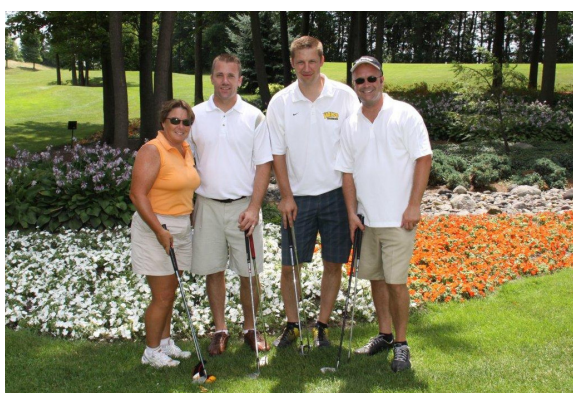
A team of golfers put their game faces on out on the course.

Restaurant, golf, waterpark, lodging, shopping