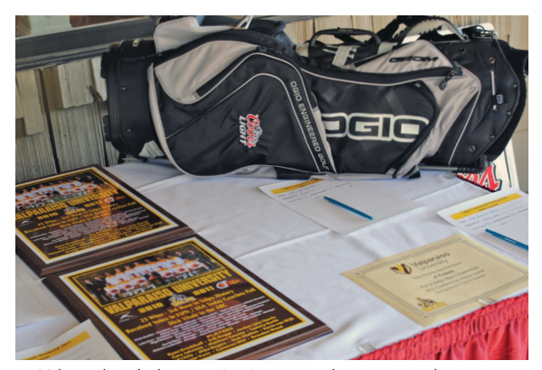
Valpo-related silent auction items run the gamut at the event. Proceeds benefit the Athletics Department.